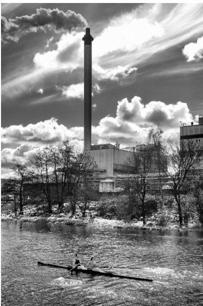
The Clyde, industry and leisure, Glasgow Green, April 2023