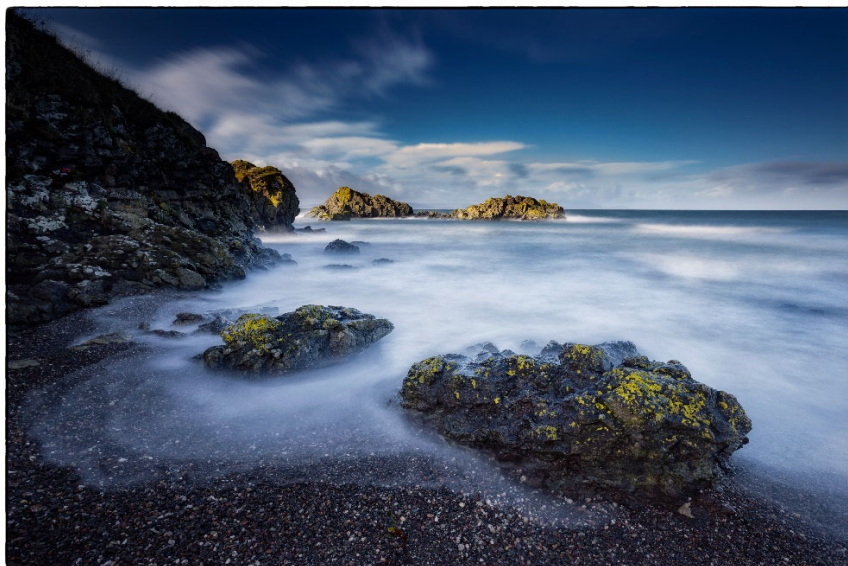
Clyde coast, South Ayrshire, April 2023