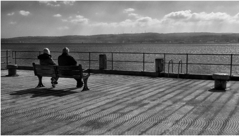
Couple enjoy the view, pier, Helensburgh, April 2023