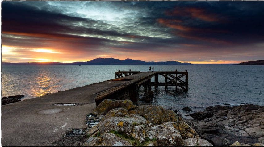
Sunset over Arran, Portencross, Firth of Clyde, March 2023