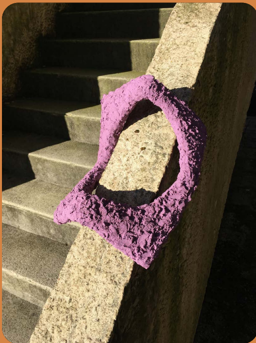
Image: Purple Brutalist Sculpture Against Exterior Stairs, 2021.

photographs, exhibited in the café, are of his own Brutalist-inspired sculptures positioned outside against the backdrop of the Concert Hall, with the sculptures themselves exhibited in the foyer. The architecture of the building and responding sculptural pieces together create an interesting interplay which forms a re-presentation of the work (photographically) in the café exhibition space.