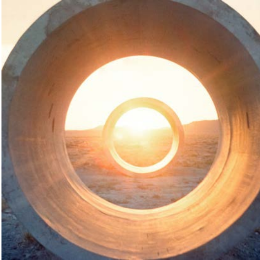
Nancy Holt - Sun Tunnels