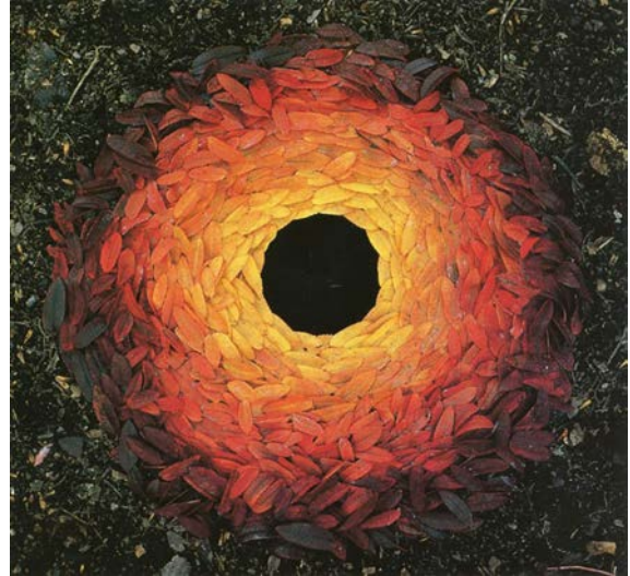
Andy Goldsworthy - Land Art